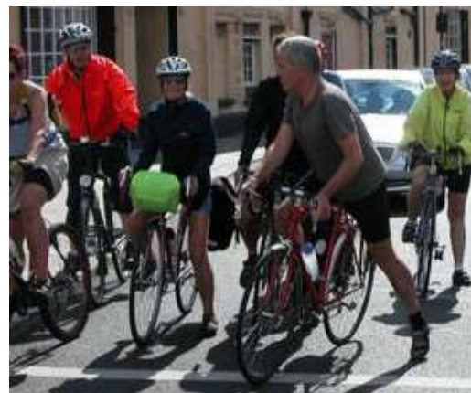
"Everyone got a spare inner tube?"

Cycling in a group is great for beginners, since a good way to learn safe routes, bike parking, and share tips about the best gear and quick repairs. For everyone, it's a great way to exercise and increase stamina – nothing encourages us to go a bit farther and a bit faster than a very supportive (and slightly competitive) group, combined with a beckoning beer and a friendly chat at the end of the ride.